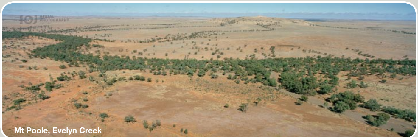
Mt Poole, Evelyn Creek

From the air one can appreciate the changes from seemingly endless sand dunes to timeless rivers and creeks which have been etched into this ancient landscape.