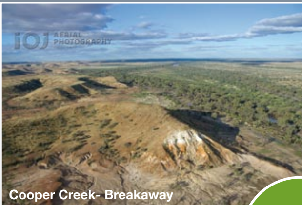
Cooper Creek- Breakaway