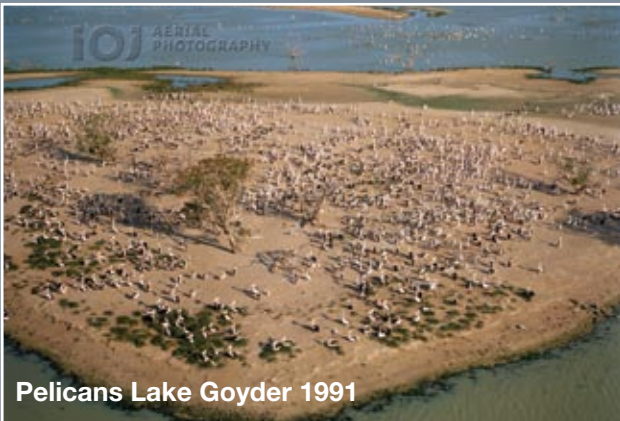
Pelicans Lake Goyder 1991