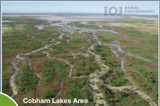
Cobham Lakes Area