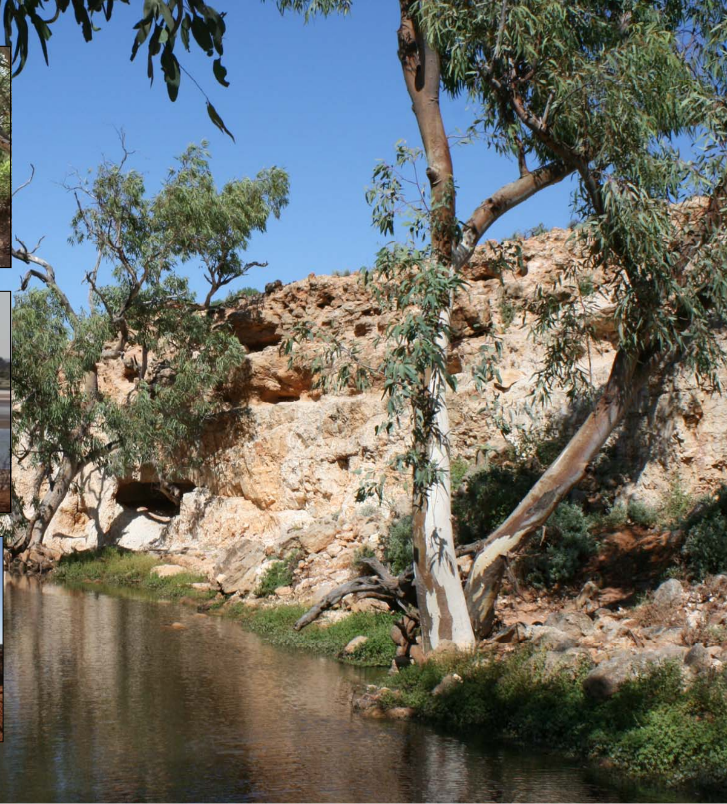
creeks and waterways