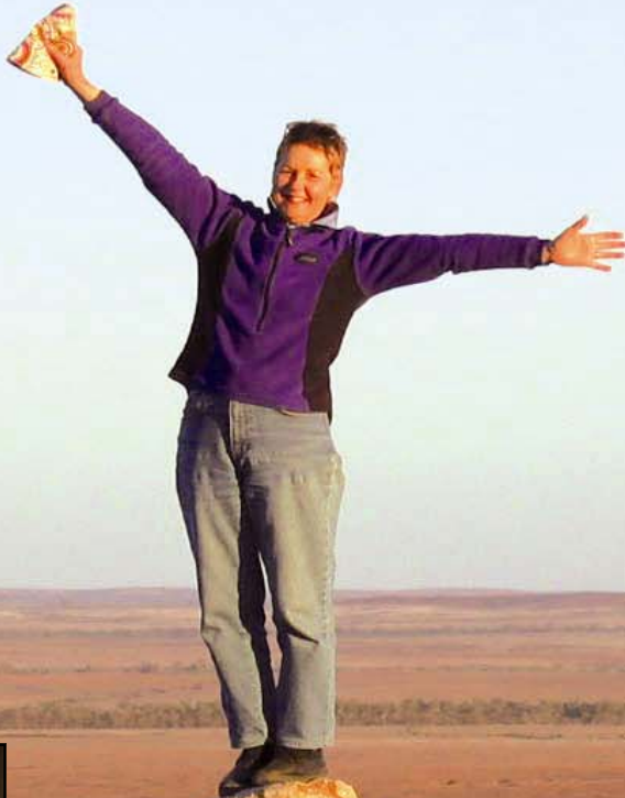
people and activity