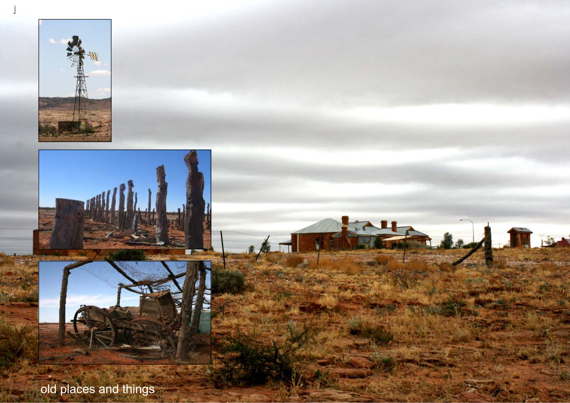
old places and things