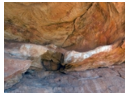
Figure 1 Wrights Cave, Mutawintji

Successive camps were made on creeks to the north west of Mutawintji, Nuntherunga, Tellawongee, Wonnaminta and Puldramata, before taking a course slightly more towards the north east. Just ten days after leaving Menindee the group reached Torowoto Swamp. Still there was no rest, and Burke hastened across the Queensland border, and onwards to Cooper Creek.