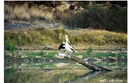
Figure 2 Cooper Creek

He was accompanied only by Wills, King, and Gray. Burke left Brahe in charge at Cooper Creek with instructions to wait at least three months. Wills asked him to hold on for four months.