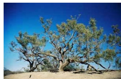
Figure 3 Dig Tree

Whilst returning to Menindee Brahe met up with Wright, and the two decided to return to Cooper Creek. By the time they arrived, Burke, and Wills were more than 50 km away. There was no indication that Burke had even been back at Cooper Creek, and Brahe and Wright left to rejoin the main party and head back to Menindee. Four men,